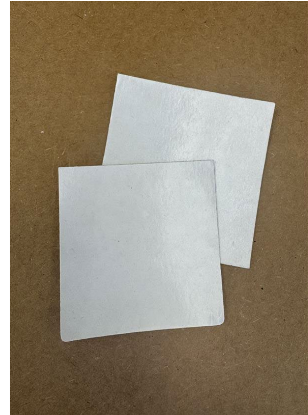
Example of PSA