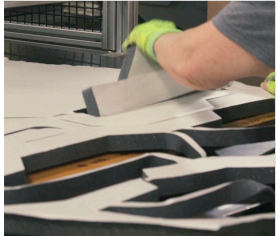
Example of a PSA applied on die cut parts